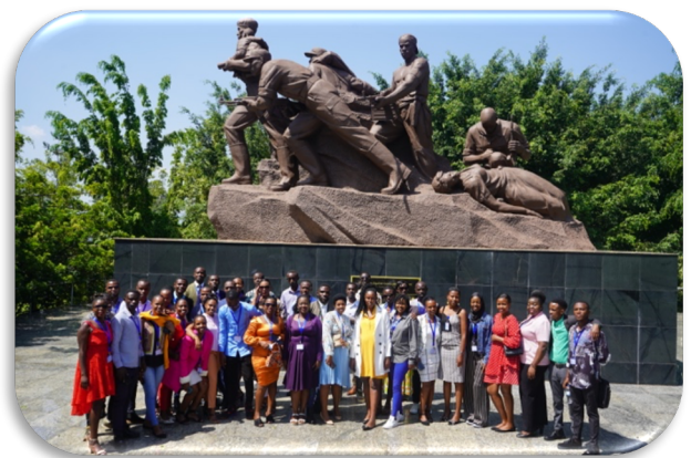
Uruburiruko rwasuye ingoro y'amateka y'urugamba rwo guhagarika Jenoside

Muri iki cyiciro, uretse amasomo bari basanzwe bahabwa ajyanye n'ubumenyi rusange mu bya Politiki, imiyoborere, amateka ya politiki y'u Rwanda, ubumenyi mu guseruka muri politiki, gutanga ubutumwa bwa politiki n'ubukangurambaga, icyi cyiciro cyanasuye Ingoro y'amateka y'urugamba rwo kubohora Igihugu no guhagarika Jenoside yakorewe Abatutsi mu 1994, aho basobanuriwe byinshi ku ngabo 600 za RPA zagombaga kurinda abanyapolitiki ba FPR bikarangira bafashe umwanzuro wo guhagarika Jenoside.