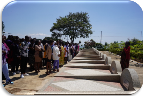
Urubyiruko rwasuye Urwibutso rwa Jenoside rwa Rebero

Uru rubyiruko kandi rwanasuye Urwibutso rwa Jenoside rwa Rebero, rushyinguwemo bamwe mu banyapolitiki bishwe muri Jenoside yakorewe Abatutsi mu 1994, aho bagiye basobanurirwa ibikorwa by'ubutwari byabaranze birimo kurwanya akarengane, ivangura, irondakoko n'ibindi byaganishaga kuri Jenoside yarimo itegurwa na Leta y'icyo gihe bikabaviramo kwicwa.