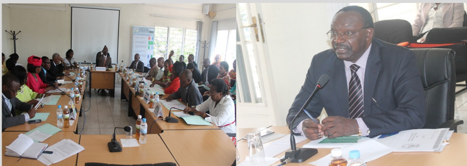
Abagize Inama Rusange y'Ihuriro

Mu kungurana ibitekerezo, Inama Rusange yashimye politiki na gahunda z'Igihugu zo guteza imbere ishoramari mu cyaro, isaba ko hanozwa ihuzabikorwa n'ukurikiranabikorwa ryazo kugira ngo zigere kubo zagenewe. Ikindi, Inama Rusange isanga Leta ikwiye gukomeza gushishikariza abacuruzi bo mu Gihugu kongera umusaruro w'ibicuruzwa byoherezwa hanze kugira ngo hagabanywe ikigereranyo cy'ubusumbane hagati y'ibyinjira n'ibisohoka; Leta kandi ikaba ikwiye gukangurira ibigo by'ubwishingizi kwitabira gukorana n'abahinzi n'aborozi hashyirwaho ingamba zigamije kunoza imikoranye n'icyizere mu guteza imbere ishoramari mu cyaro.